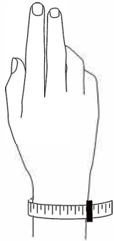
USING THE ERNESTO BUONO PAPER SIZER